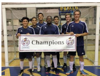
The Expendables Summer 2016 Champions Division Winner

The summer of 2016 proved to be the most exciting summer season thus far. Eight adult teams participated in the summer season with games in June and July with the team The Expendables winning the single, large, Champions Division. In addition to announcing the division winner and awarding championship t-shirts, golden boot and golden glove awards were given out, door prizes were given to spectators, and halftime music added a festive atmosphere for all. This winter there will be sufficient quantity of teams for both a Champions Division and a First Division. Further growth will add a second division, third division, etc. as North Alabama FUTSAL continues winter and summer seasons each year.